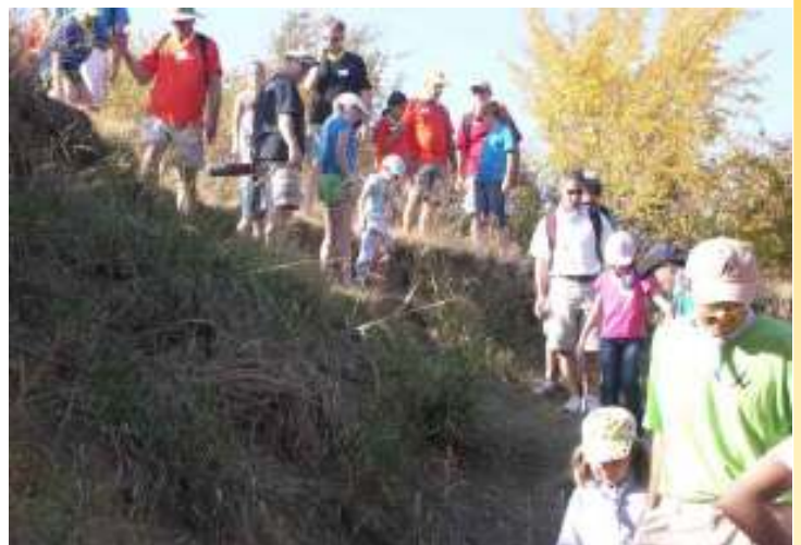
Fourth graders explore Arbor Hills Nature Preserve

In the fall, HATS invited YMCA graduates and other fourth grade girls and their dads for our new "Dad and Daughter Treks" program. Groups met at Flag Pole Hill in September and at Arbor Hills Nature Preserve in November for a one mile hike, stopping at stations for large group games, small group games, and dad and daughter breakout games.