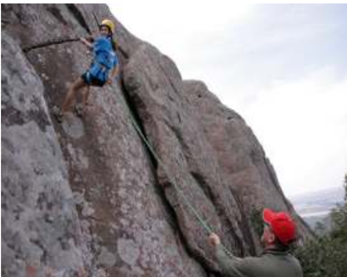
Dads and daughters learn to trust each other

H ATS hosted its rock climbing campout for seventh graders at the Wichita Mountains Wildlife Refuge near Lake Lawtonka in Lawton, Oklahoma.