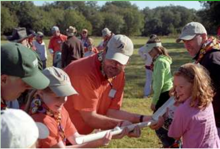
Dad and daughter games teach teamwork and cooperation

wonderful experience I got to share with my dad. We had a bunch of fun.”